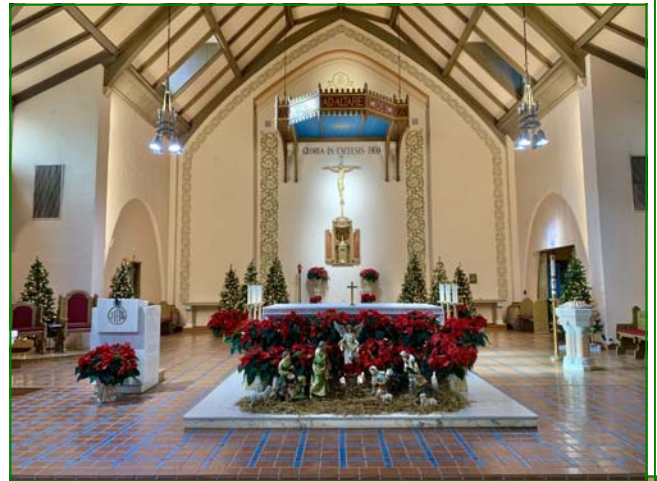
St. Cecilia Church

Thank you everyone who helped decorate Our Parish for Christmas!