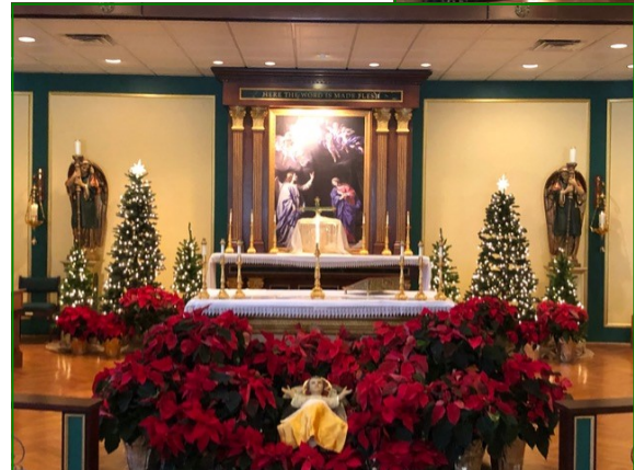
St. Gabriel Church