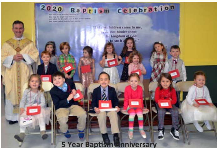
5 Year Baptism Anniversary