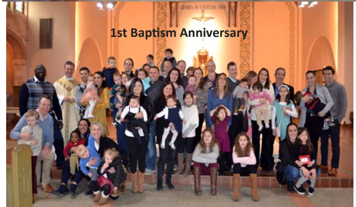
1st Baptism Anniversary