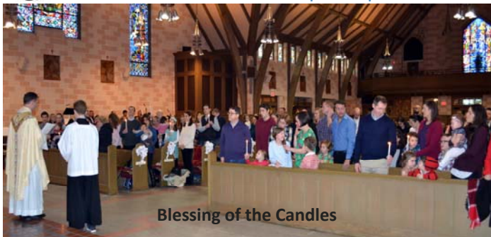
Blessing of the Candles

Thank you to all the families who participated.